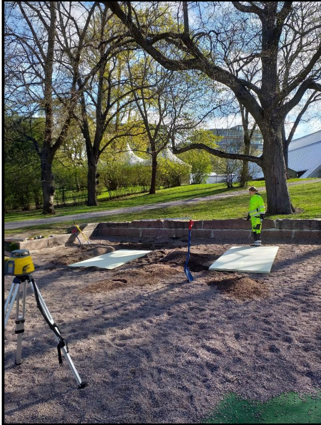
Ground frost insulation