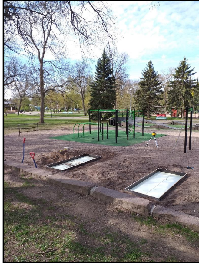
Ground frost insulation