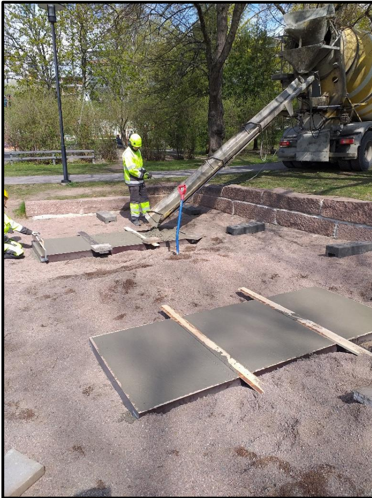
Adequate drying time